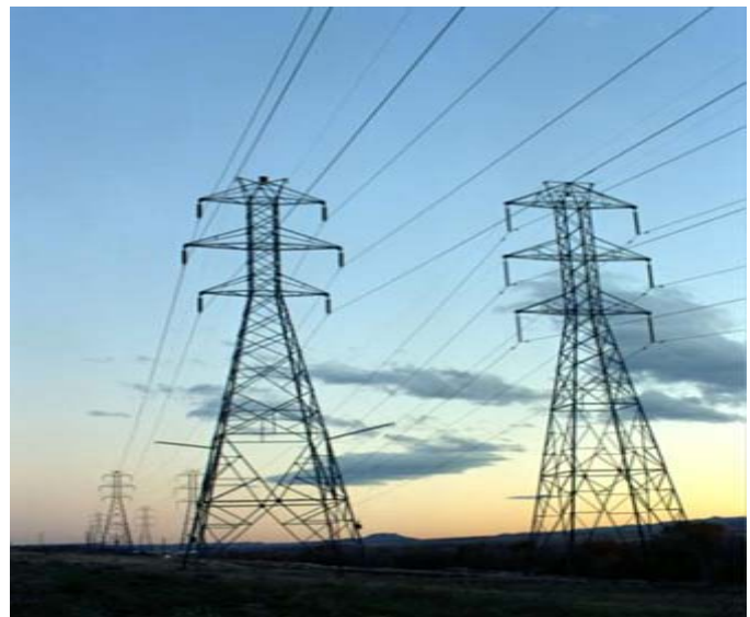
[from the presentation given by P Overholt, Dept of Energy, USA]

Mr Overholt described the Office of Electricity Delivery and Energy Reliability in terms of leading the US effort to modernise the grid, enhance security and reliability and facilitate recovery from disruptions. He described Wide Area Measurement Systems (WAMS) which addressed the lack of wide area visibility and time-synchronised data recorders noted in the review of the US/Canadian 2003 blackouts. WAMS led to the North American SynchroPhasor Initiative (NASPI: www.naspi.org ) which aims to create secure synchronised power system data measurement. Moving on to the present day, Mr. Overholt described the Phasor Technology Research Roadmap, which ultimately intends to deliver enhanced utilisation of the existing power transmission infrastructure.